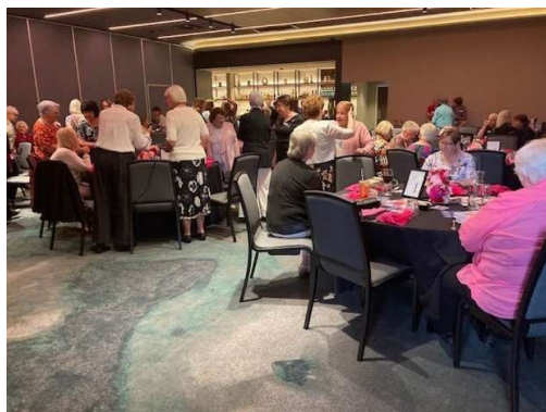
Lots to chat about