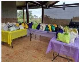
Bags ready for Share the Dignity