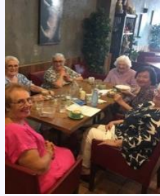
Members in Kiama

Our active member numbers dropped to 11 this year and we have 3 of those in retirement or aged care living, so attendance at meetings of 6 or 7 is the regular expectation. In August we attended a dinner held by one of our supported charities, Samaritan's Purse, who runs Operation Christmas Child. We also continued to support our Smith Family "daughter" who is now finishing her schooling. Our AGM in September saw us elect a new committee for next year albeit with multi-recycling all round! For Inner Wheel Day in January a small group met at Circular Quay and had a lovely lunchtime social get together.