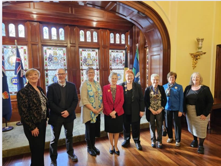
Her Excellency with District A70 Ambassadors and members

Celebrated 100-year anniversary with an afternoon tea, male choir and celebrity speaker in November 2024.