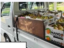
Mangoes being delivered