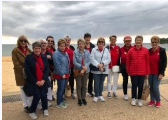
Two for Ten walk

We are a vibrant club of 44 members, who actively fundraise through stalls, fashion parades, trading tables and movie nights. All monies raised are poured back into our local community providing funds to local schools for student welfare, Cancer care and research, Cord Blood research, meals and care packages for the vulnerable along with funds to District and International charities. We enjoy friendship with regular morning teas, dinners and making the world a better place.