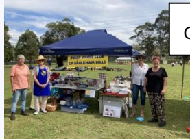
Community Market day