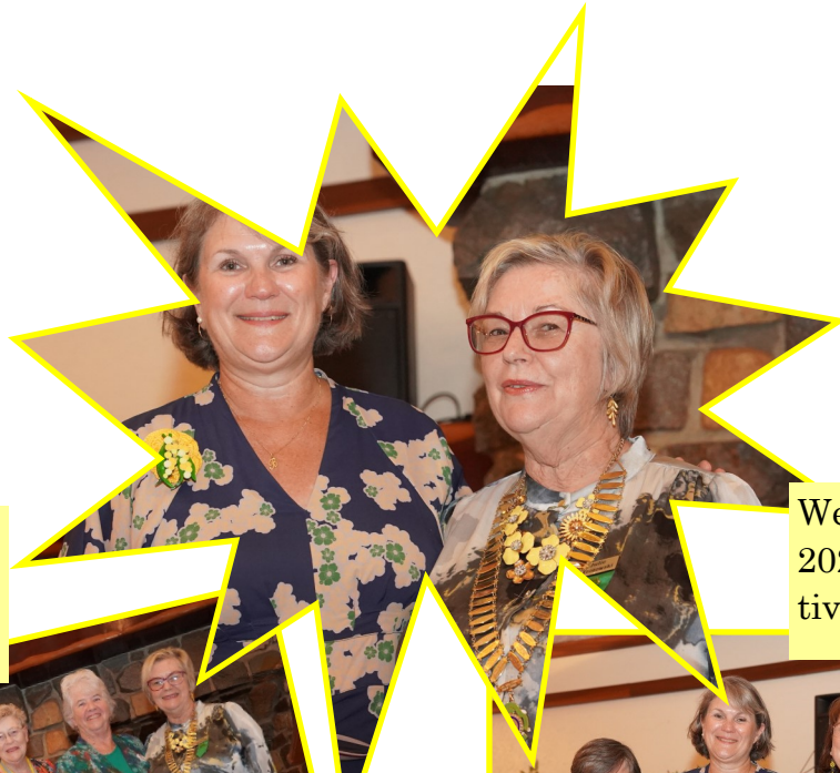
Welcome to all the 2024-25 IWA Council Members