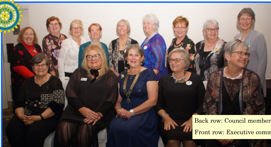
Back row: Council members Front row: Executive committee