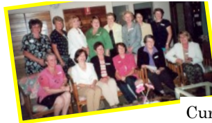
Charter members 2004

Our Club continues good attendance and great friendship at our monthly meetings and various outings. We support local organisations and enjoy having representatives of same speak to our members.