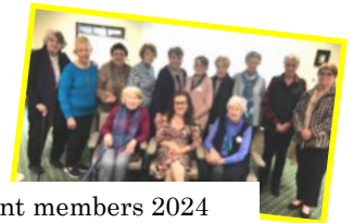
Current members 2024