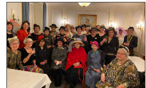
Holbaek Oestre Inner Wheel, Denmark