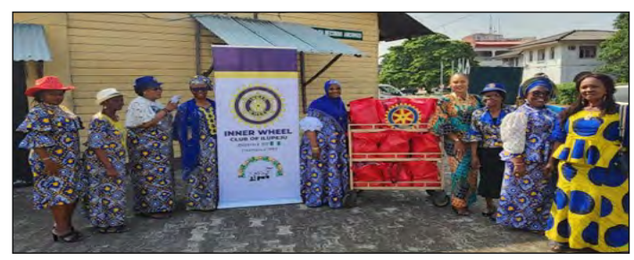
Inner Wheel Club of Ilepuju at the Orthopedic Hospital Igbobi to visit the Children's ward and also to present the Children Christmas gift.