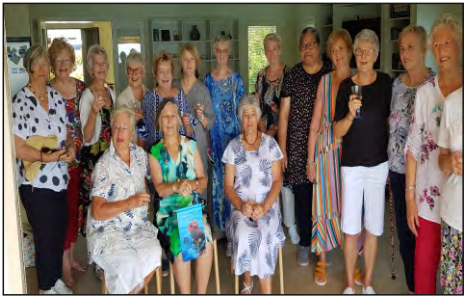
Auckland East at Waiheke Island