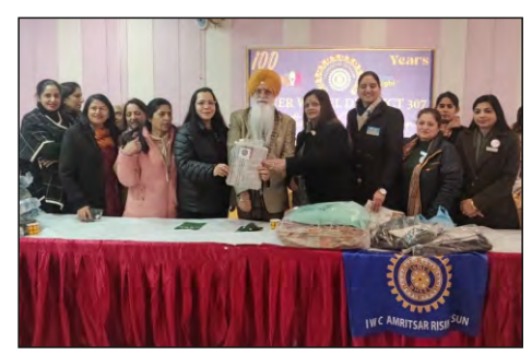
D307 AMRITSAR RISING SUN