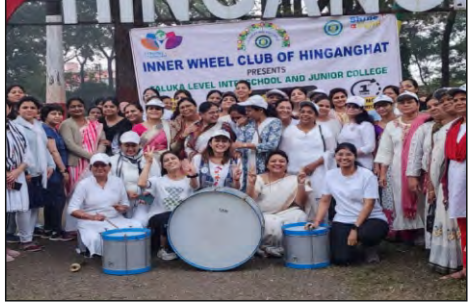
D303 IWC HINGAWAT WALKATHON