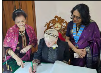
Writing comments to visitor's bool for Martyrs