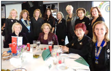
D242 IWCs Beyoglu and Beyazit