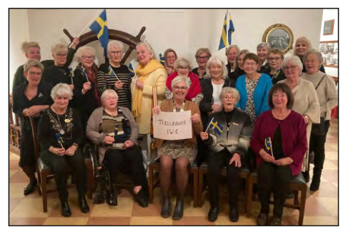
D239 Trelleborg IWC