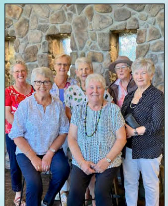
NDC Club Burnie.