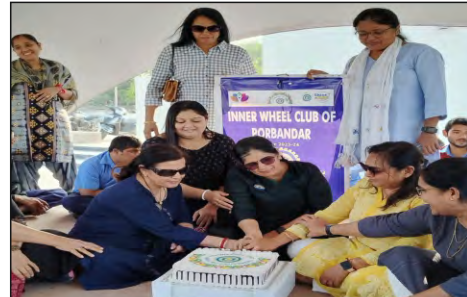
D306 Competition for special children by IWC Porbandar