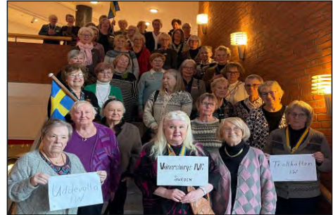
D236 Uddevalla Vanersborg and Trollhattan IWC