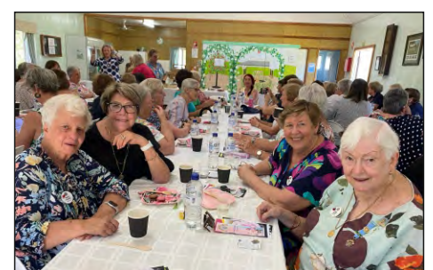
Inner Wheel Day Toowoomba at the dedication of Rose Gardens