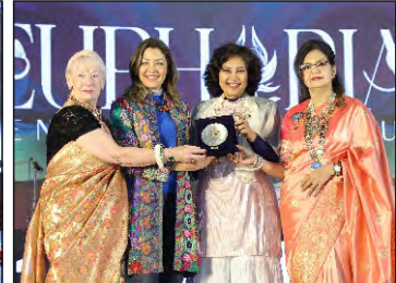
With Famous Artistes