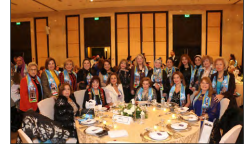
CENTENARY IW DAY CELEBRATION