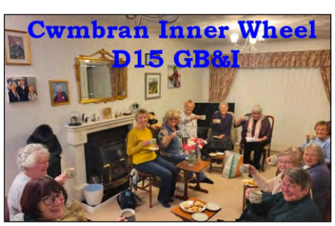
IWC of Cwmbran D15 GB&I