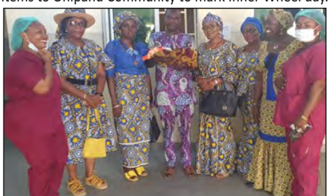
D914 Inner Wheel Club of Awka posing with the father of the first baby