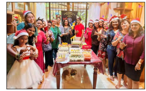
IWC Butterworth's Xmas and Centennial Celebration