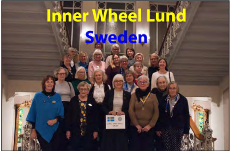
IWC Lund Sweden