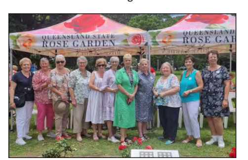
Brisbane West ClubMembers at the dedication of the rose gardens A77 District Centenary Project followed by lunch.