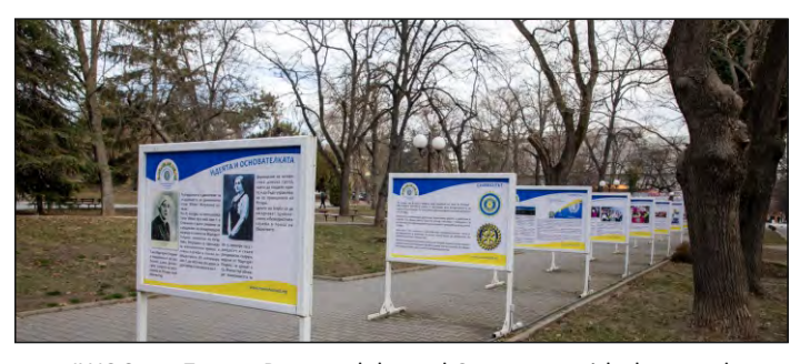
IWC Stara Zagora Beroe celebrated Centenary with the grand opening of National Travelling Exhibition