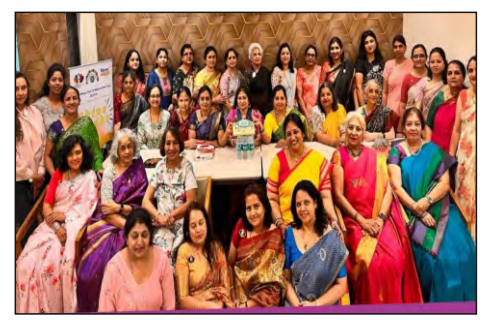
D318 IWC MYSORE MIDTOWN