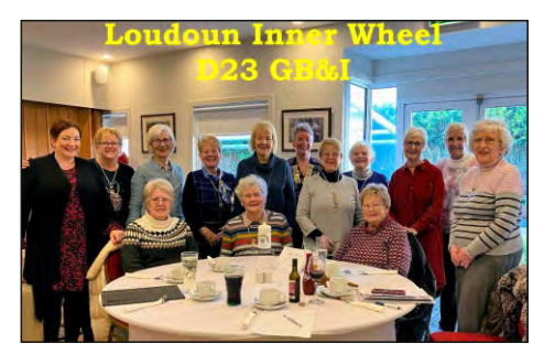
IWC of Loudoun D23 GB&I