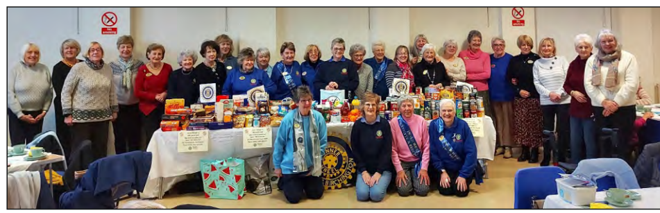
D12 of Broadstairs, Margate and Westgate & Birchington clubs