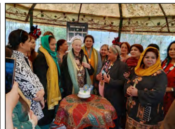
Meet and greet the President for brunch at a farm house