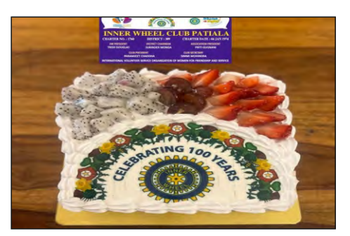
D309 IWC PATIALA