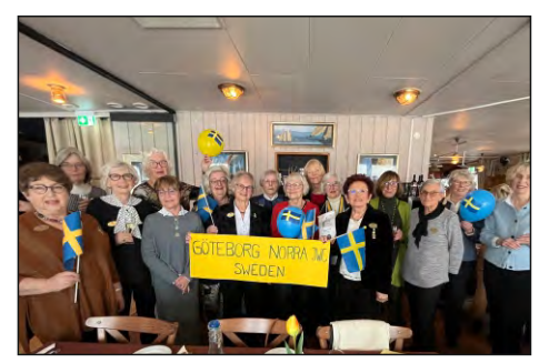
D236 Gothenburg North