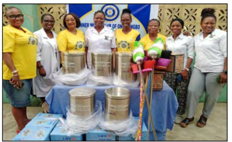
D911 Inner Wheel Club of Onigbongbo and staff of Onigbongbo PHC