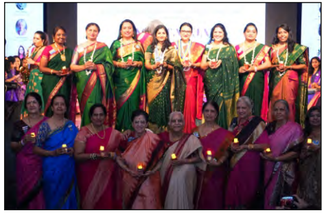
D319 SHINE A LIGHT