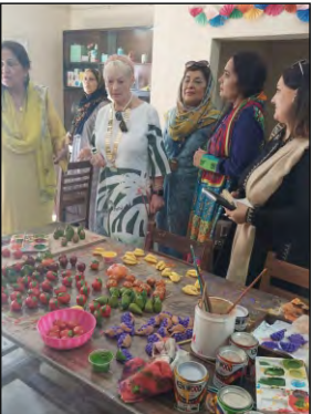
Interesting Art Work