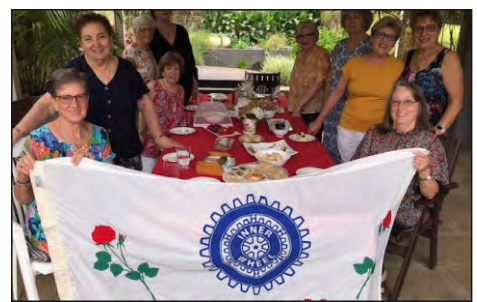
IW Balmain NSW District A51 Centenary Morning Tea

Every year, Inner Wheel Day is a special festival that we members celebrate. Our celebrations often include those less fortunate for we do believe that Fellowship and Service go hand in hand. This year being the Centenary, the celebrations too were bigger, better, brighter for we were going to Shine A Light on Inner Wheel turning 100. If the wishes for the Centenary videos began in November, the Facebook posters began more than 10 days before Jan 10th. Let us see them here and then how different countries celebrated in the pages that follow.