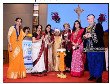
Lighting of the lamp