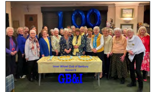
D9 IWC of Banbury