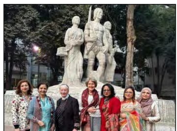
City tour- Dhaka University