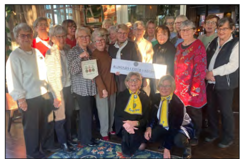
D236 IWC Alingsas Lerum Vargarda