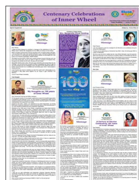
Suppliment published on Daily newspaper