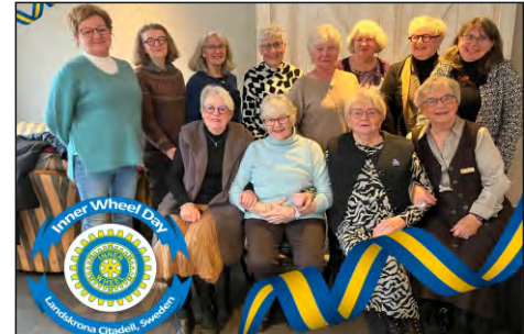
D239 Landskrona Citadel