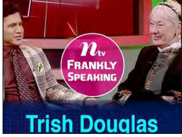
Interview with National television channel