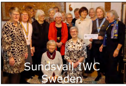
D232 Sundsvall IWC