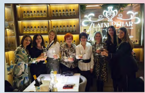
Inner Wheel Club Bijeljina