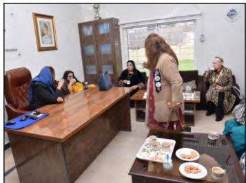
At APNA GHAR. An orphanage visited in evening of 28 January supported By IWC Islamabad Cosmopolitan