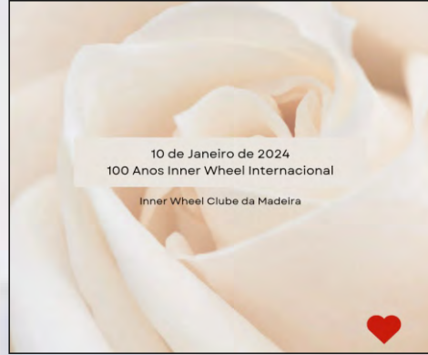
NDC IWC of Madeira Portugal