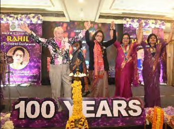
Leaders Of Club District Association and IIW in one frame