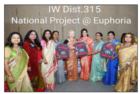
D315 100 BAGS PROJECT