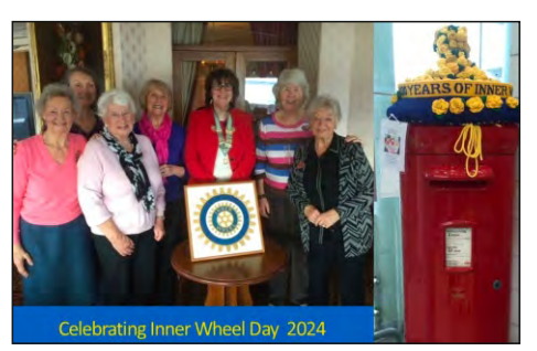
IWC of Torquay D17 GB&I