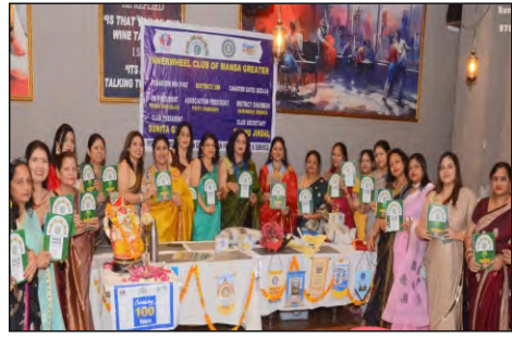
D309 IWC MANSA GREATER