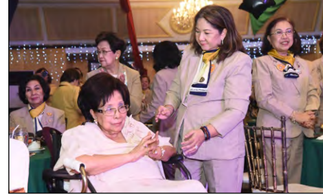
IWD Past Nat Reps honoured on IWday