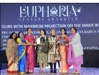
Honouring Overseas Guests