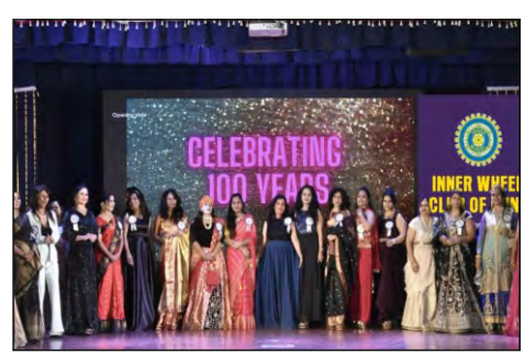
D313 IWC Pune hosted INNER WHEEL QUEEN CONTEST. 26 participants were chosen out of 85 entries Winners were awarded