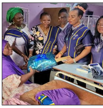
910 IWC Gbagada visitedl Maternity ward to gift babies born at the hospital cash to mothers and bedsheets to hospital