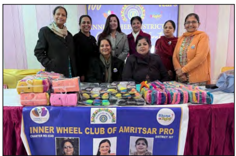
D307 IWC AMRITSAR PRO