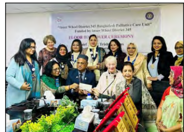
Chittagong Maa O SHishu Hospital IW Palliative care unit inaugaral