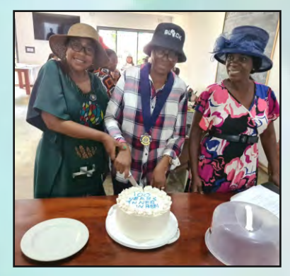
IWC LUSAKA Ladies in hats Cake Cutting