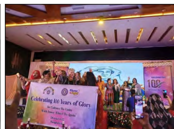
Gala Evening at Chottogram