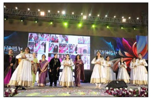
{\rm D301} showcasing the history of Inner Wheel India.