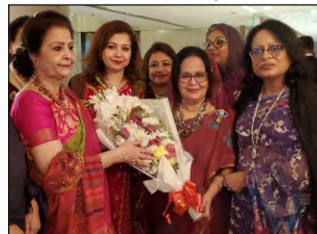
Fellowship dinner hosted by NR

Day 2 : On 21st January a whole day celebration for 100 years of inner wheel took place at hotel Sheraton. Inaugural of IW Fair by IIW President Trish Douglas. Parade of Centennial Presidents with IIW President's participation. She was shown a Power Point Presentation on IWD 345 activities and projects.