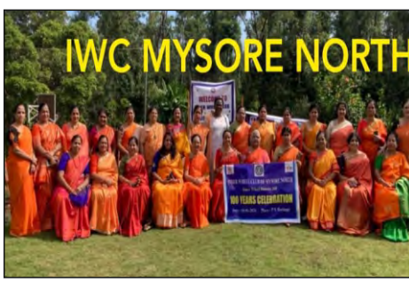
D318 IWC MYSORE NORTH