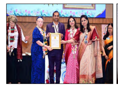
100 Happy Schools Record

I would like to extend my deepest thanks to the District Executive Committee (EC), Past District Chairmen (PDCs), Club Presidents, and all members of District 313 whose presence and support were instrumental in the success of this event.