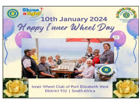
Port Elizabeth West