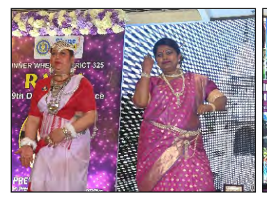
Heritage Walk Tribal jewellery