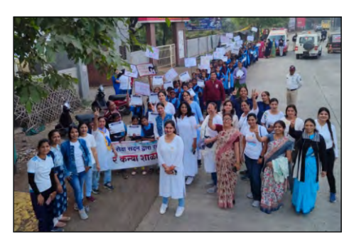
D303 IWC AKOLA WALKATHON