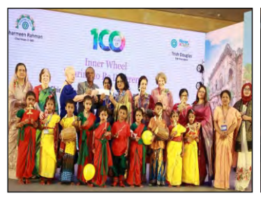
Donation to SAHIC- a school for special children