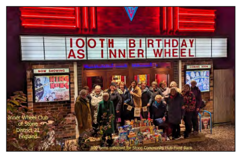
IWC of Stone D21 GB&I