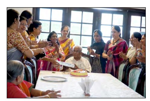
D320 IWC Mettupalayam