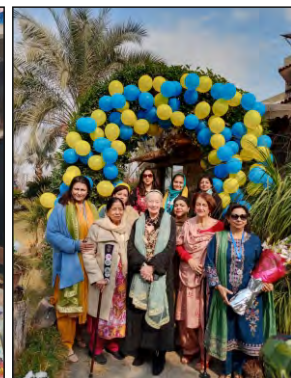
Beautifully decorated Entrance to Farmhouse