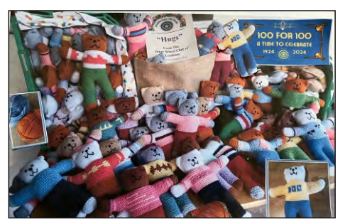
D23Loundon Club member knitted 100 teddies to donate to charities