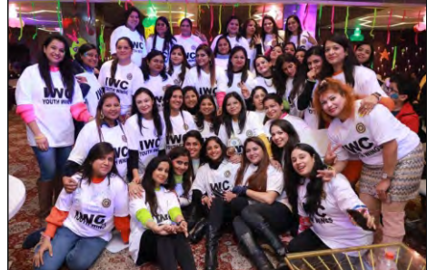
D310 IWC YOUTH WINGS