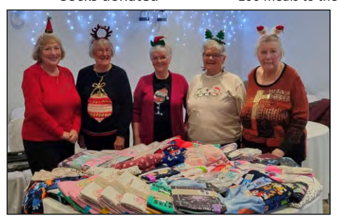
D2 IWCMotherwell & Wishaw collected 122 pairs of pyjamas to donate