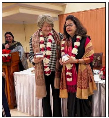
A Time Foe Smiles