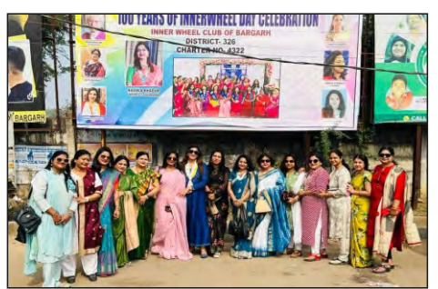
D326 IWC BARGARH