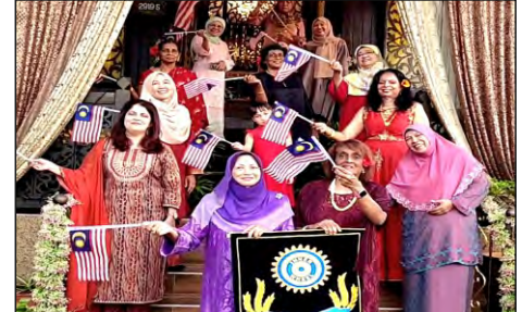
IWC Alor Setar's Centennial photo