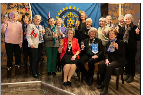
IWC Arendal Nedenes