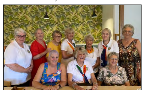
Hervey Bay Club enjoying friendship and lunch