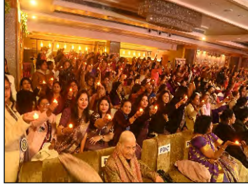
Shine A Light