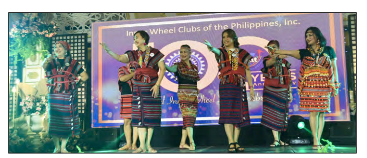
IWD Day dance