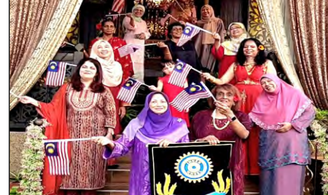
IWC Alor Setar's Centennial photo