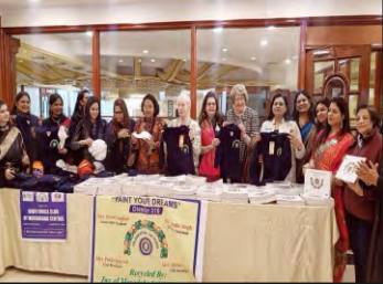
Service Project Sweaters Foe Needy