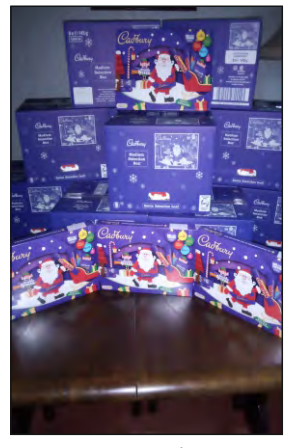
D128 IWC St Helens 100 for 100 Selection Boxes