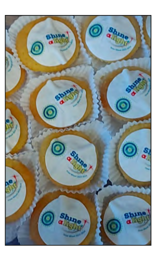
D12 Westgate & Birchingto baked 100 cakes & decorated to donate