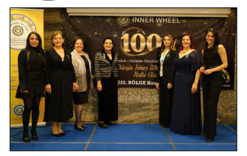
D222 Executive Committee members at the end of the night