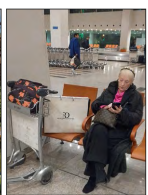
At the Airport