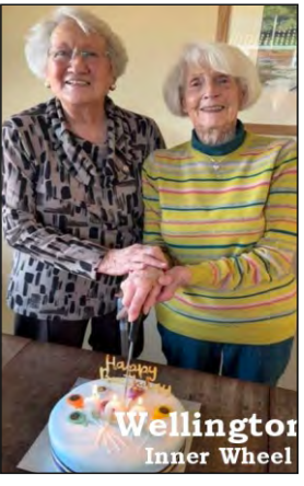
IWC of Wellington D20 GB&I IWC of Sedgefield D3 GB&I