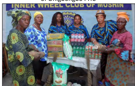
Inner Wheel Club Mushin celebrated with the elderly