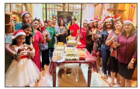
IWC Butterworth's Xmas and Centennial Celebration