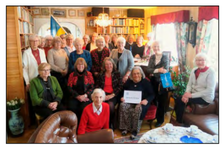
D234 IWC Vasteras St Ilian