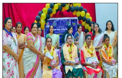
D317 IWC Dandeli felicitated 4 nurses in the memory of Margarate Oliver Golding on 100th IW Day