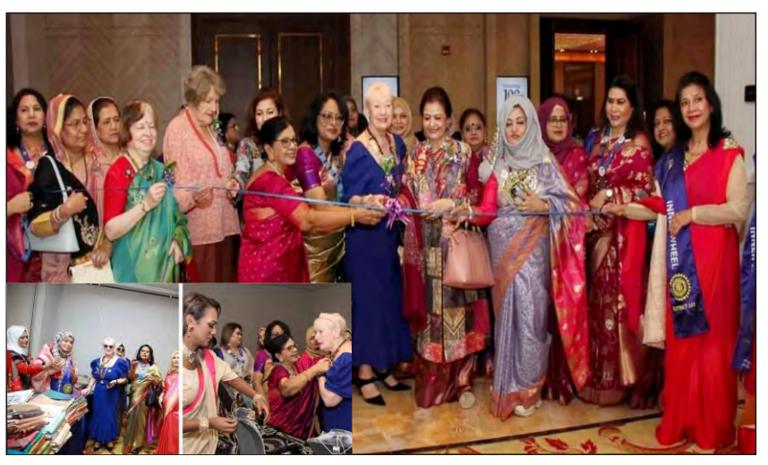
Inaugarated a fair