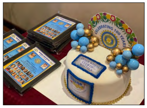
IWCWATTALA the cake