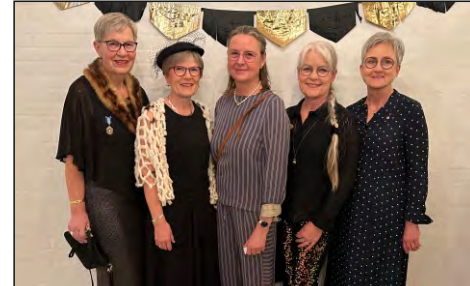
5 ladyes from Bjerringbro Inner Wheel distrit 44_1