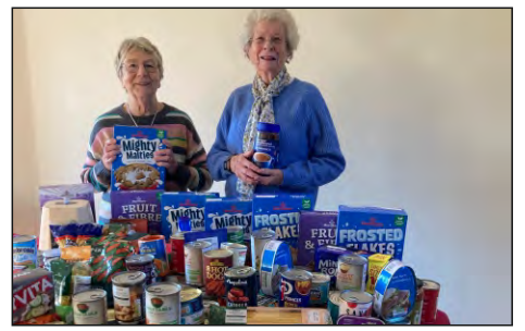
IW Club of Seaford D25 GB&I