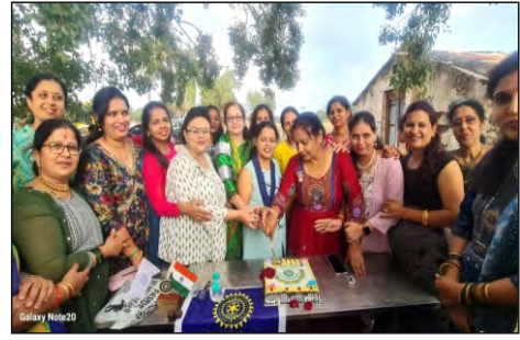
D317 IWC Gadag MT Celebration by cutting cake