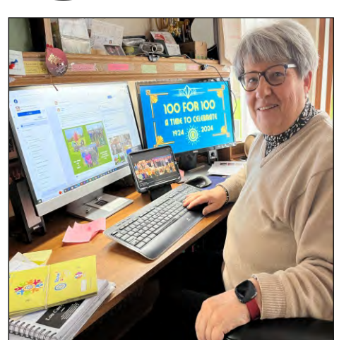
D1 Dist EdJean took on the 100 for 100 challenge for Facebook posts