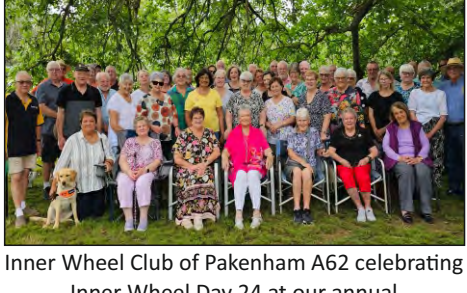
Inner Wheel Club of Pakenham A62 celebrating Inner Wheel Day 24 at our annual Brekfast in the Park