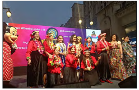
D314 IW FEST