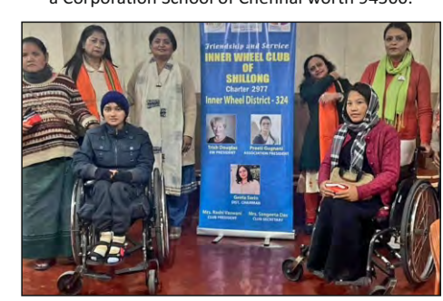
D324 IWC SHILLONG SERVICE