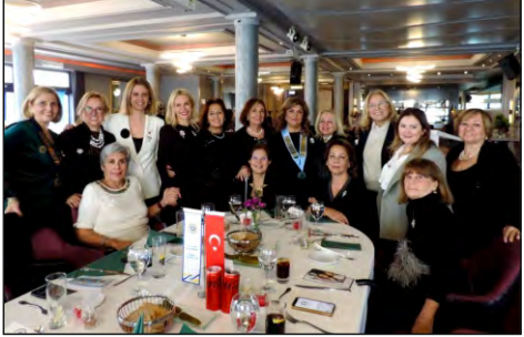
D242 IWC Dolmabahce and friends from Rotary Club