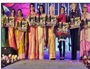
IIW Web Magazine Release