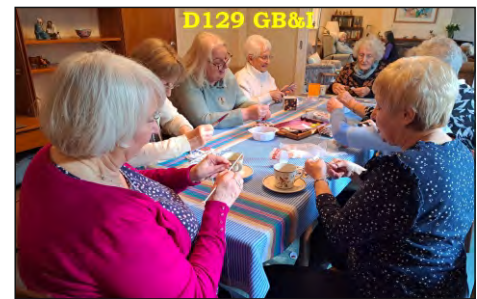
IWC of Roborough D129 GB&I