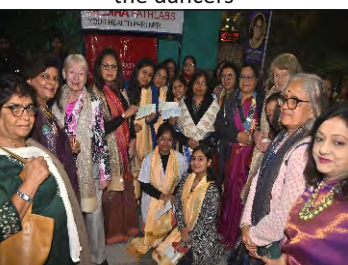
Paramedic students get cheques