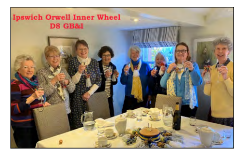
IWC of Ipswich Orwell D8 GB&I