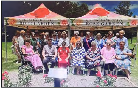
Toowoomba members at dedication of Rose Gardens