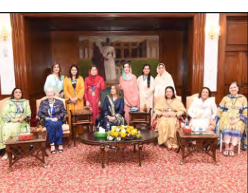
At Governor House with first Lady