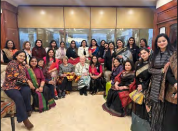
With The Dignitaries