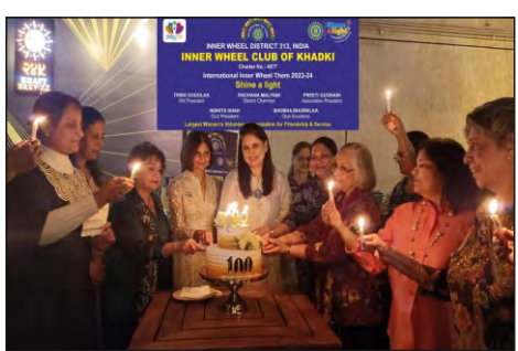
D313 IWC KHADKI