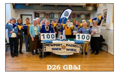
IWC of Newport Pagnell D26 GB&I