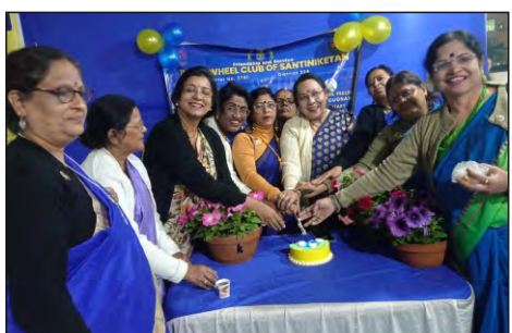
D324 IWC SANTINIKETAN