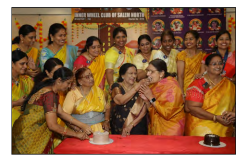
D298 Salem North