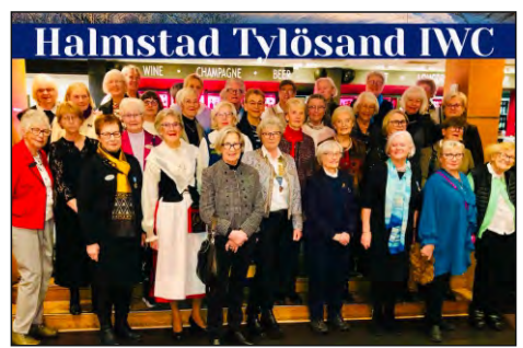
D240 fran Halmstad Tylosand