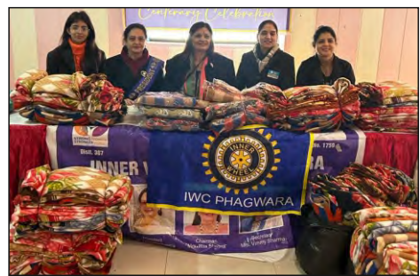
D307 IWC PHAGWARA