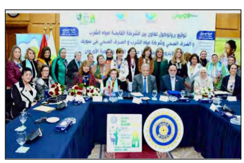
Project for D95 Egypt & Jordan where 18 clubs were involved