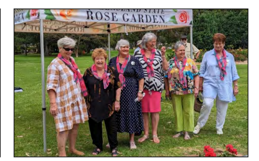
Wishart Members-Rose Garden Toowoomba