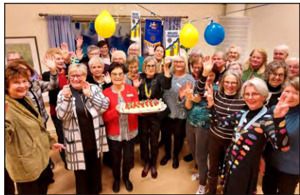
D233 Borlange Tunabygden