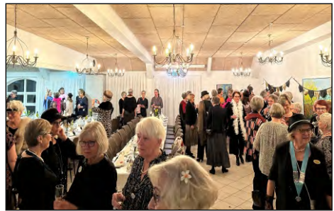
Party distrikt 44