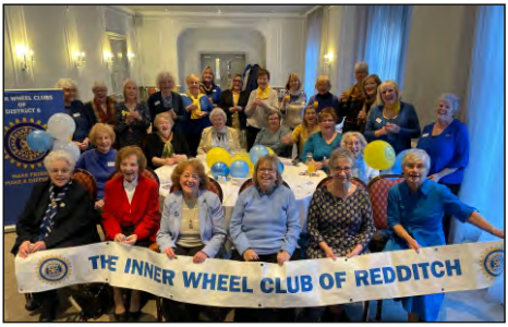
IW Club of Redditch D6 GB&I