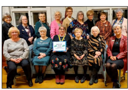
D232 IWC Boden