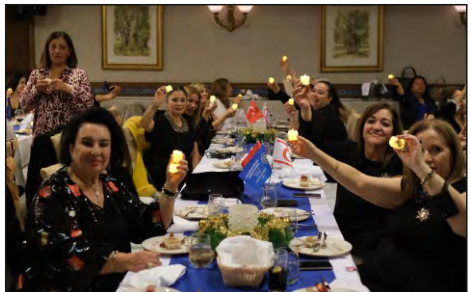
Shine a light candles lit for the Centennary cake moment