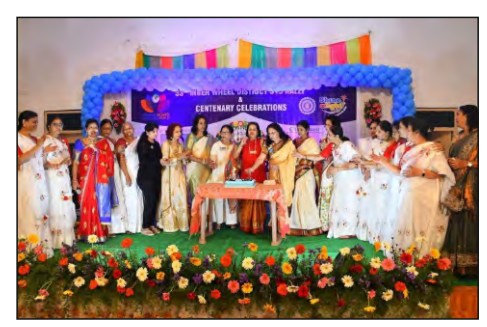
D315 CENTENARY CELEBRATION