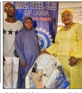
D 912 IWC Ogba presented baby packs to a pregnant woman.