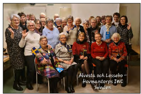
D240 IWC Alvesta and Lessebo Hovmantorp