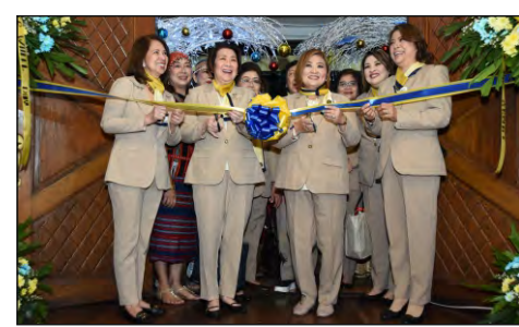
IWD Ribbon cutting