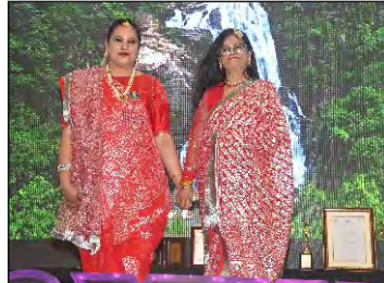
Heritage Walk Muslim Chhapa