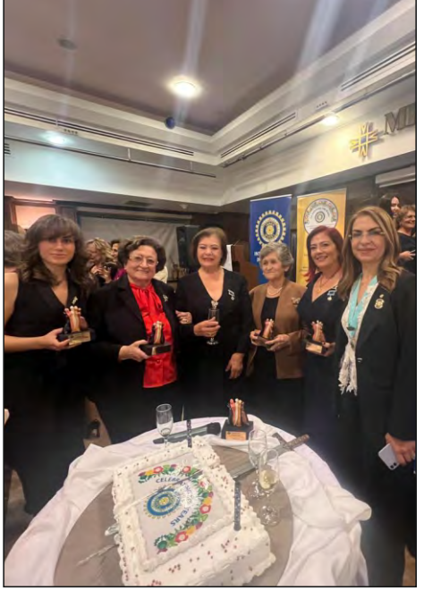
Next Gen together with founders of the first IW clubs of Northern Cyprus