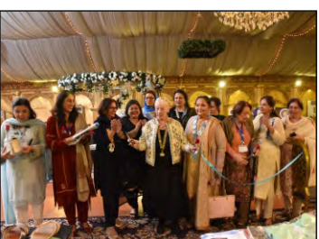
At D342 Conference