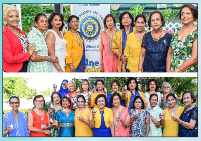
Trinidad & Tobago Members Celebrating