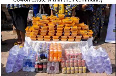
D914 IWC Abakilike fed 100 beggars in the street.