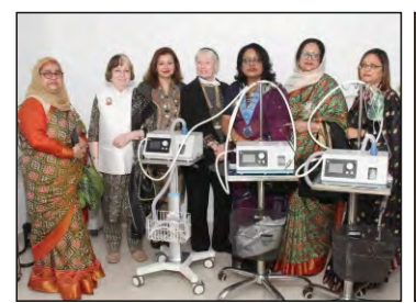
Donation medical equipments by D345 at Ahsania Mission Cancer Hospital for NICU unit