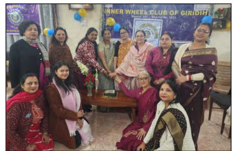
D325 IWC GIRIDIH CELEBRATION