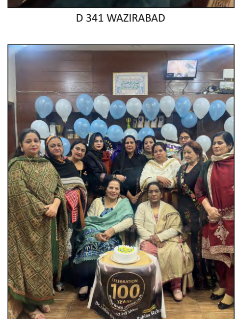
IWC Sahiwal Jasmine