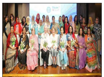
Fellowship dinner with the proposed new district members