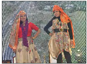
Heritage walk Indo western