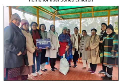
D308 IWC Roorkee RAIN SHED