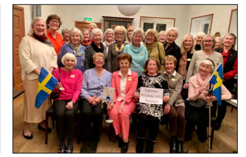
Sigtuna Arlanda IWC