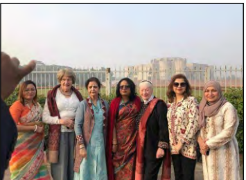
City Tour- National Parloment