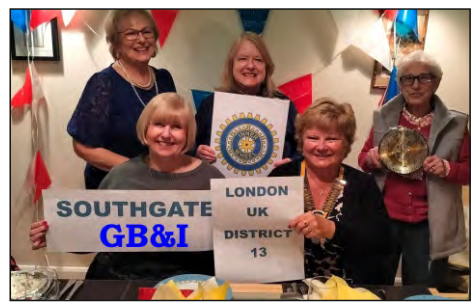
IWC of Southgate D13