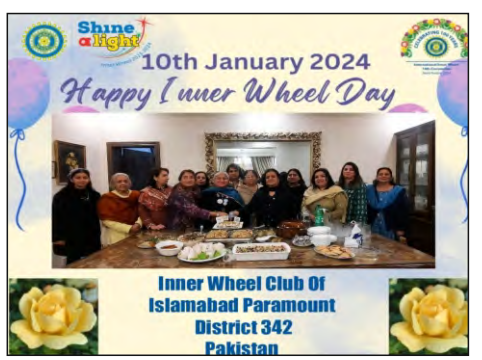
IWC ISLAMABAD PARAMOUNT D 342