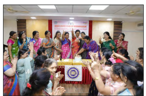
D302 IWC VIZIANAGARAM