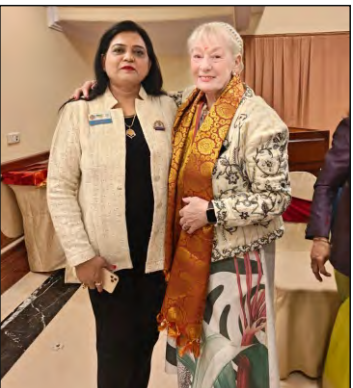
DC WITH IIW President