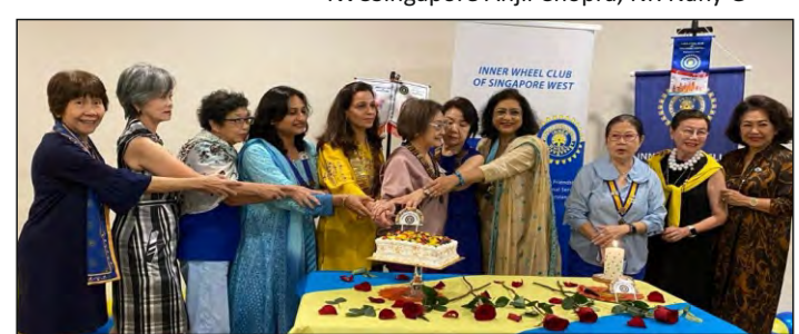
National District Club officers cutting the cake