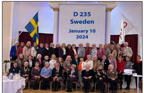
D235 IWC Dagen