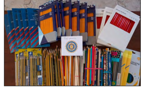
D24 IWC Chelmsford Mildmay, supplies for Gambia School