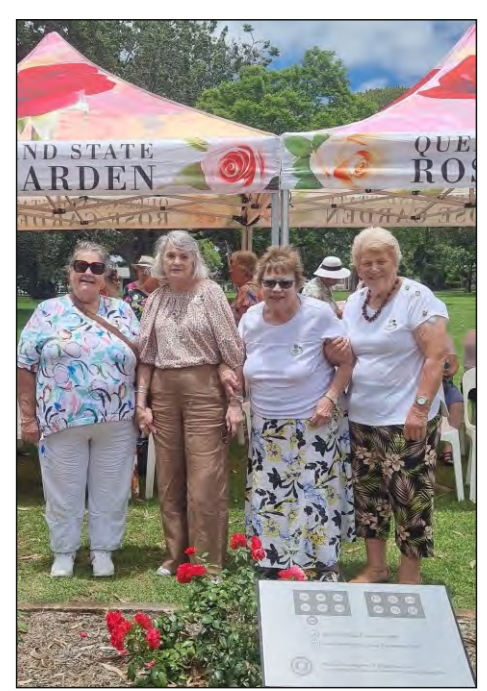
Brisbane Toowoomba State Rose Garden for dedication of A77 District Centenary Project and lunch