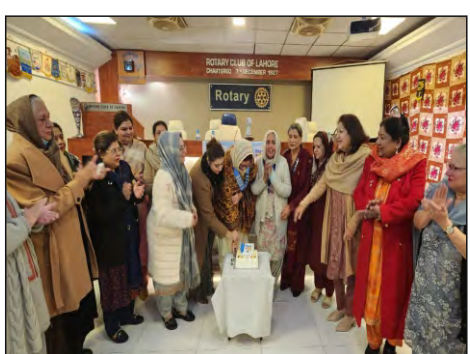
D 341 Lahore Main