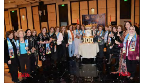
THE CAKE READY TO BE CUT