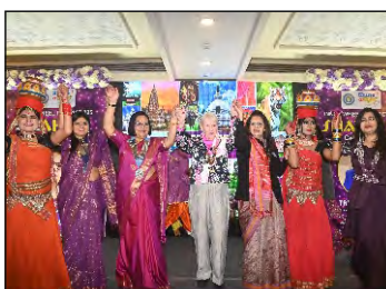
IIW Pres, AP and Dc join the dancers