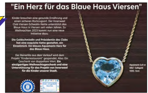
Inner Wheel Club Göppingen from District 86