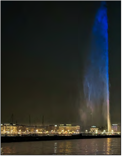
Famous icon The Jet d'eau rising from Lake Leman was lit up in Inner Wheel colours on Jan 10th IWC Nyon Geneva Lausanne Morges jointly celebrated