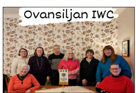
D233 Overwatch IWC