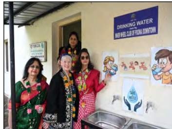
Drinking water facilities