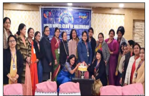
D311 IWC HALDWANI