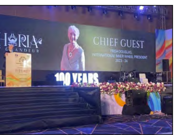
IIW Pres Addresses The Gathering