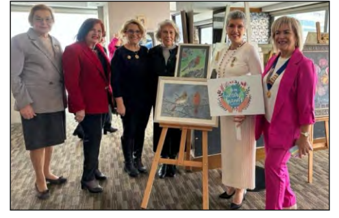
D244 Pictures of the IW members at the exibition venue