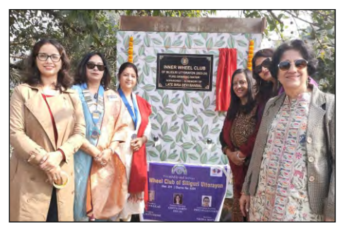
D324 IWC SILIGURI UTTARAYON SERVICE DRINKING WATER