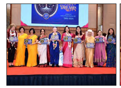
HISTORY OF D313 Released