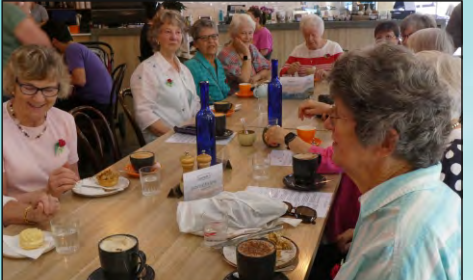
NDC Clarence - Austalia