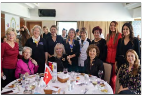
D244 IWC Ege members