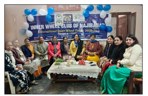
D310 IWC NAJIBABAD