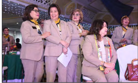
IWD Past Nat Reps honoured on IW day