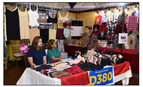
IWD Bazaar D380