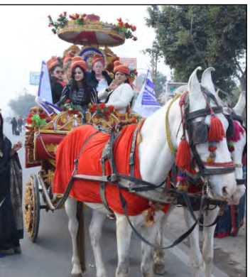
Set For The Drive