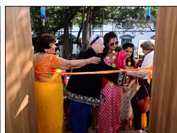
Happy school inauguration