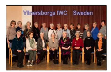
D 236 Vanersborg IWC