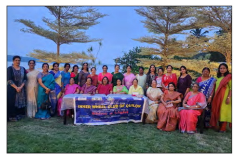
D321 Quilon Celebration