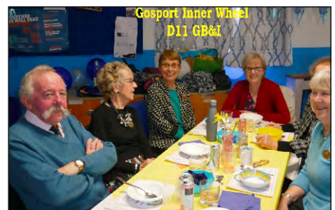
IWC of Gosport D11 GB&I