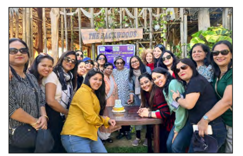
D324 IWC DIBRUGARH