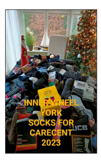
D4 York Club 400 pairs Socks donated