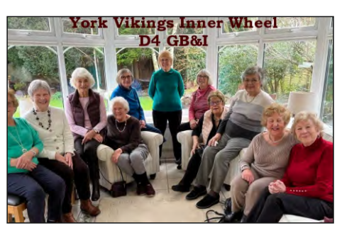
IWC of York Vikings D4 GB&I