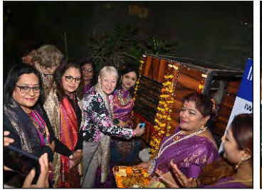
Paper plate making machine