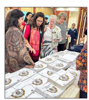
2000 Notebooks from Recycled paper for underprivileged students

3 projects have also been done in District 310