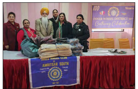
D307 AMRITSAR SOUTH