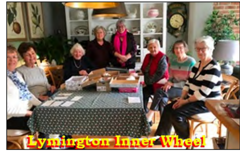
IWC of Lymington D11 GB&I