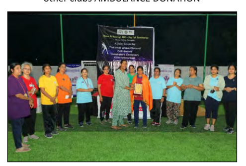
D320 Coimbatore zone sports meet