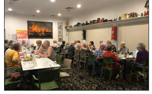
Bundaberg Bundaberg Sunset celebration Lunch