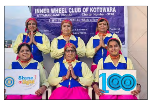
D310 IWC Kotdwara