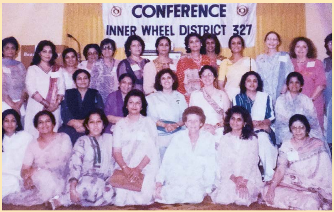
March 1989. First District 327 Conference under my Chairmanship.