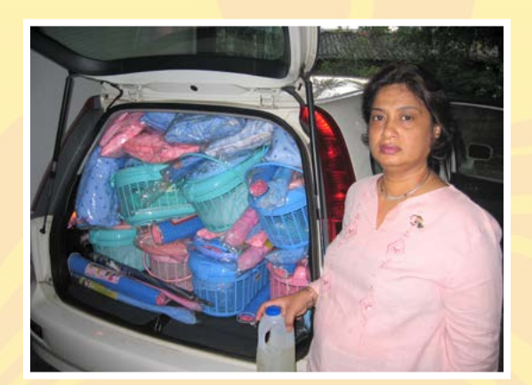
Loading maternity packs for distribution.

The southern insurgency movement in Sri Lanka, which had commenced in the early 80s, was now disrupting our civil life. Whilst in the north, we were facing a threat from the Tamil Tigers. The insurgents then took a strategic decision to attack and harm families of servicemen. Two of my younger brothers were serving in the Armed Forces.