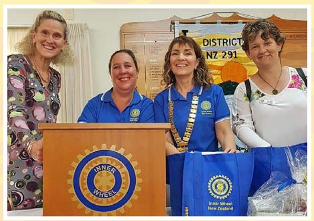
Friends gained that I would never have met without Inner Wheel

INNER WHEEL MEMBERS CARE—through my journey and speaking with Members, the feeling of friendship gained in Inner Wheel is different to that of any other organisation. We work together, we support each other and we care. When my mother passed away my granddaughter asked why I had so many cards sent to me, the answer was simple, the majority were from members throughout New Zealand who had heard my sad news and wanted me to know they cared.