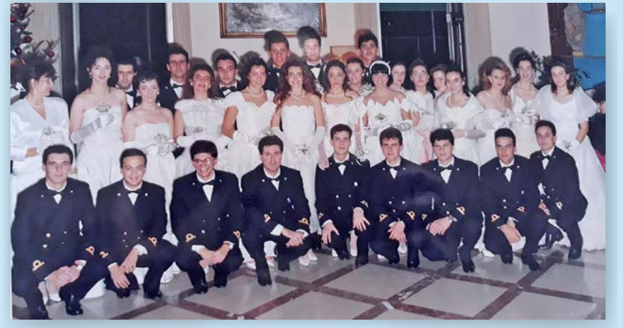
The debutantes and their partners

The fundraising was successful thanks to the support of numerous press articles and TV interviews.