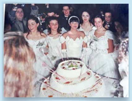
The spectacular birthday cake

A rich buffet was offered at midnight followed by the debutantes blowing 18 candles on a spectacular birthday cake. It was really a magical soirée for the 16 young women making their first appearance in fashionable society.