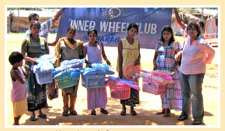
Maternity packs for pregnant women

As I reflect on the past, I would think that this was my first-hand experience of Inner Wheel Friendship where we went as a team and were able to extend some form of kindness to those in need, and see the happiness in their eyes.