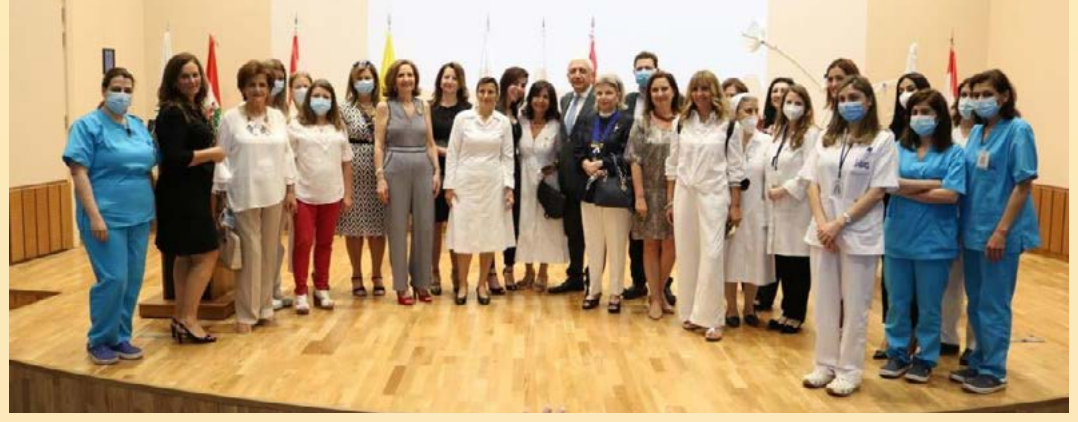
The ceremony at Geitaoui Hospital, Beirut for the delivery of the equipment, in the presence of the Directors of the hospitals and other authorities