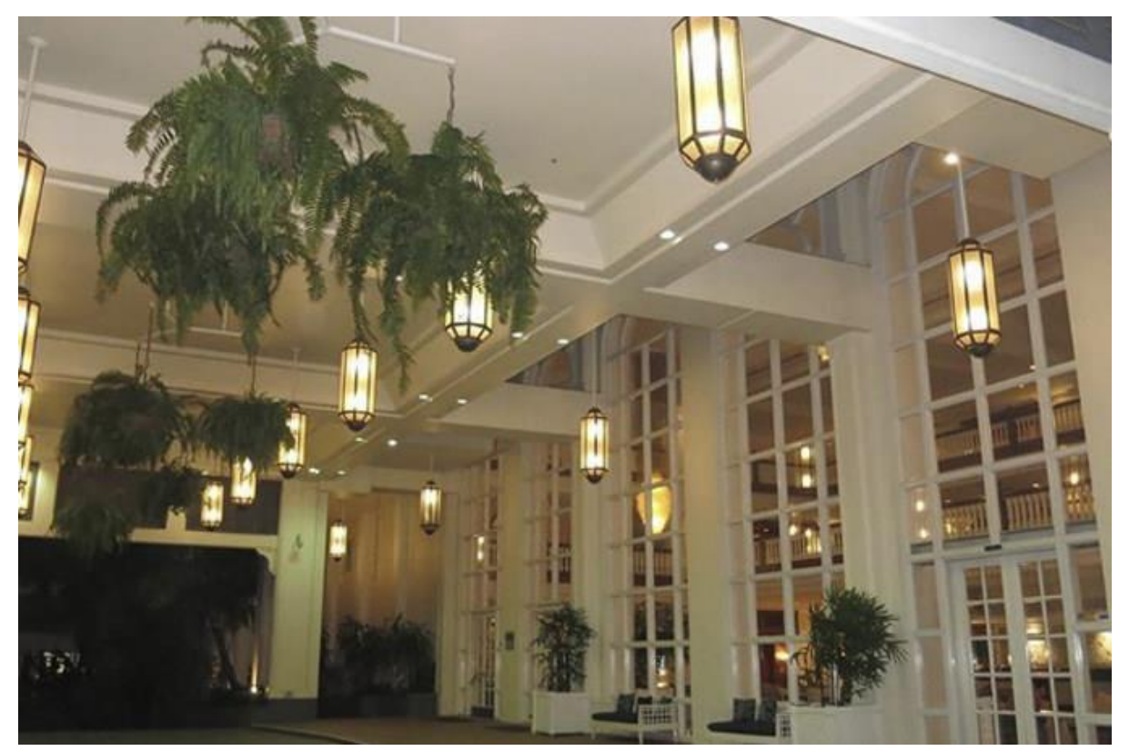
THE CONFERENCE LOCATION

dinner being the first function at 6 pm. On arrival at the airport look out for the Inner Wheel balloon arch where conference ambassadors will be available with help if needed.