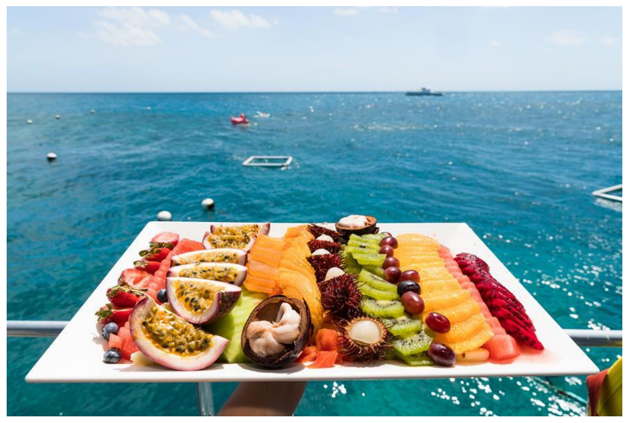
Welcome to Tropical North Queensland

Tropical climate - no coats, jumpers or umbrella's required. Exotic tropical fruit in abundance and of course tropical cocktails! A morning walk along the boardwalk at sunrise is a great way to start the day. Our CBD is compact and easy to walk around, our major shopping centre Cairns Central anchored by Myer is four blocks away and our new aquarium, the only aquarium in the world dedicated exclusively to the habitats and species of tropical North Queensland, is only three blocks from the hotel - a great place for lunch.