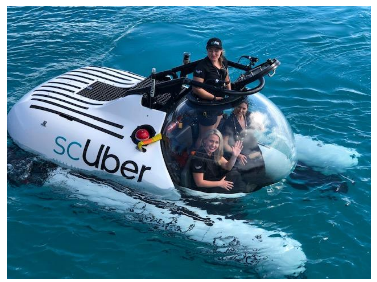
Great news for Cairns

Submarine Experience Launched on Great Barrier Reef