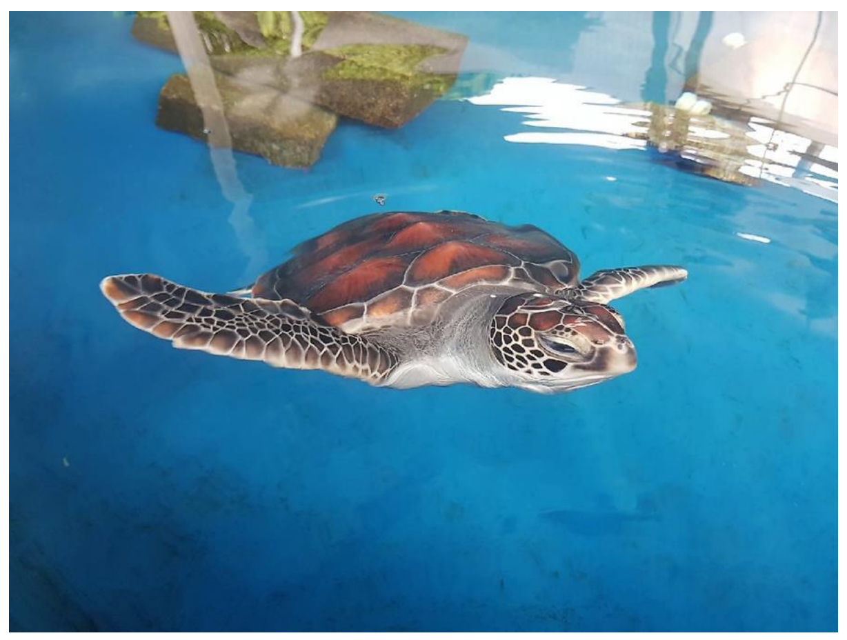
Tilly - photograph taken on 20th May