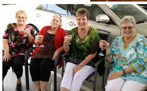
Bottom row L to R:- IW Day at Royal Botanic Gardens in Melbourne; A77 pre-dinner drinks Gayndah style.