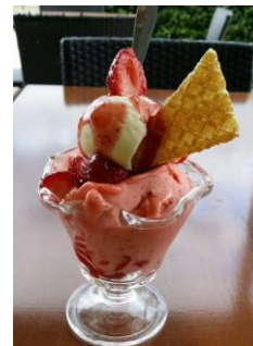
Top row L to R:- Receiving a Tassie cheeseboard from A80 DC Colleen; Canberra Belconnen banner presentation with surprise visitor Usha from India; A70 Strawberry sundae