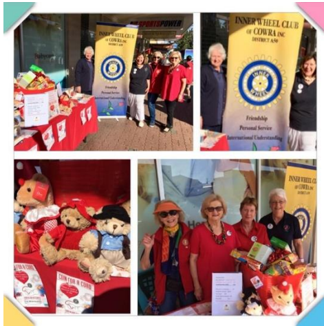
Coin for a Cord Day Cowra Club.

Hi Everyone, just a quick message from the National Project Team to say a big thank you for all the efforts Clubs and Districts put into Coin for a Cord Day. A few photos below show how Clubs help promote the National Project on this day.