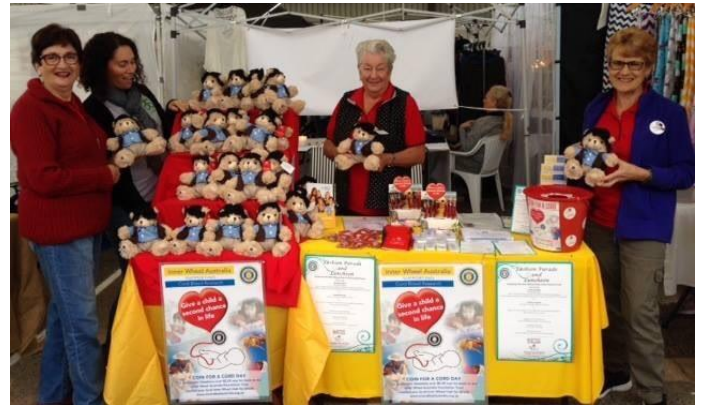
District A52 Cord Blood Display at Shelly Beach by the Gosford North IW Members