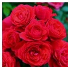
'Gift of Friendship'