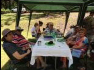
Right and Above: Trivia night for Cord Blood.