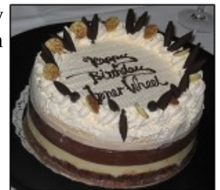
Indulgence - two Birthday cakes!!