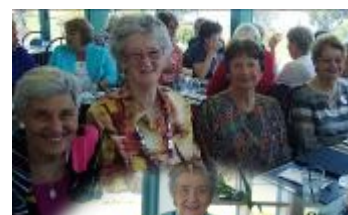
The Big 'O' Birthday Party.

Recent activities include interesting guest speakers, and Big 'O' Birthday Lunch for our members. Our club Birthday Dinner with games and humorous/glamorous hats, Christmas party with hamper donated to local charity and Christmas tree adorned with small gifts from a local opportunity shop.