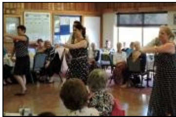
Swing Dance Demonstration.

Members have been very busy organizing events to support our fundraising target for 2015 - Juvenile Diabetes. These included a 50s Swing Music and Devonshire Tea that attracted nearly one hundred people; a Melbourne Cup afternoon tea where plans were made for the November Trash and Treasure run by Lindisfarne Rotary.