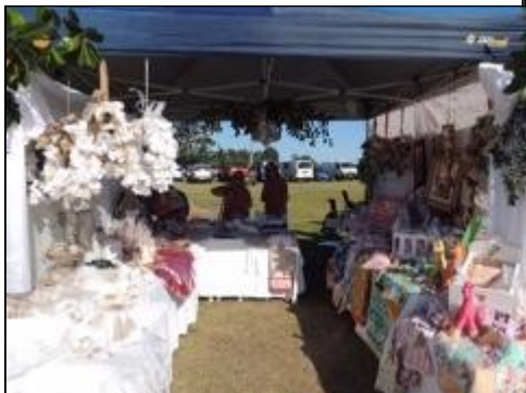
Right: Gosford North's Christmas Party.