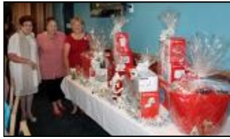
Gifts for 'Betty's Place'.

Local Women's refuge, 'Betty's Place' was the recipient of a substantial pack of necessities at Christmas.