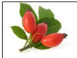
Orange Rose hips.

The rose plant is left alone until the rose hips form and semi-dry to a bright orange. The hip is dissected to reveal the miniscule seeds. Rose hips average twelve seeds. Seeds are sprinkled over potted soil and left to grow, germinating in about 8-12 weeks.