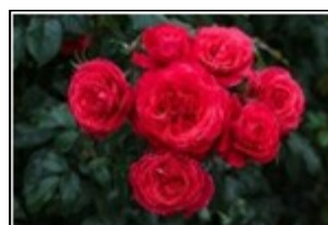
Our 'Gift of Friendship' rose