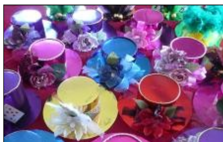
Those beautiful Hamilton hats at Conference.

The last months of 2015 were busy celebrating; conference, our Birthday, Christmas and of course Inner Wheel Day in January.