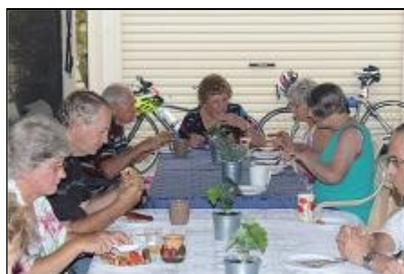
Mandurah celebrates Inner Wheel Day.

We got together just before Christmas for lunch and then went to a show at the local performing arts centre. We celebrated Inner Wheel Day with an early morning breakfast at the home of one of our members. It was a really relaxing time after busy Christmas activities.