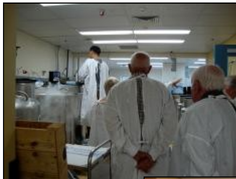
A visit to the new Cord Blood Bank Laboratory.

There are a lot of helpers now and the Service has grown quickly from a little room in a delivery dock at the back of the Hospital, to a wonderful new extended Laboratory shown in the photo with some of members on our visit in November.