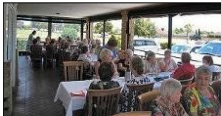
Members from Kalamunda celebrate Inner Wheel Day with other WA Clubs.

The Lunch and Learn was very good this year, really informative. Our Christmas was a great night, lovely food and a very interesting Raffle, where if someone won a prize, someone else could take it from them.