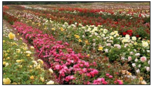
Some of Treloar's trial plots

Second stage testing sees the new rose planted in the trial grounds for another three years or more, culling inferior plants as required.