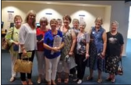
One of the tour groups.

Members, partners, friends and international guests came together to celebrate IIW day with a tour of a state icon, the State Library. The tour was led by the friendly and knowledgeable library volunteers. This was followed by a meal in the Library café.