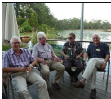
'The Boys' enjoyed Christmas Lunch at Abundance Cafe.

Christmas presents were distributed to the Salvation Army Appeal and also to the Women's refuge, along with Christmas Stockings for babies, and special pamper packs for the Mums who are in our local Base Hospital at Christmas.