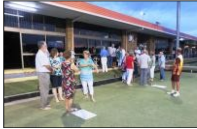
OK - this is how it is done!

We have celebrated our Christmas by having a bare foot bowls night, our donation was given to a newly built children's hospice Hummingbird House