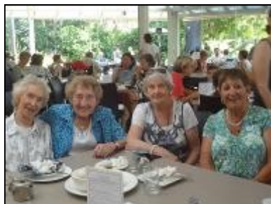
Members from District A60, A61 and A62 enjoyed Inner Wheel Day at the Melbourne Botanical Gardens.

Enjoyed Christmas dinner and a 'Kris Kringle for all in December, with a Guest Speaker who spoke on the 'Days for Girls' project, which we wish to support.