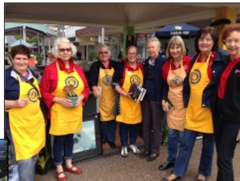
Above and Left: Gosford North with their Christmas stall.