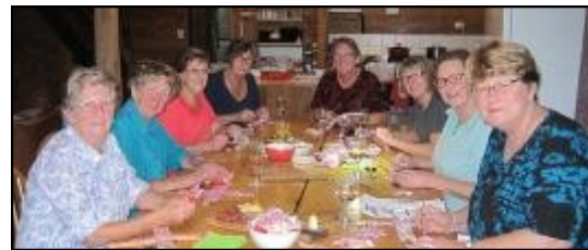
Making fabric stars to provide funds for wigs for Cancer sufferers.

"Bring and buys" to sausage sizzles, enabled us to help those supporting the homeless, comfort to those suffering Dementia and Alzheimer's, and help spread the joy of Christmas by donating children's' gifts to the Salvation Army. We look forward to an active year of service in 2016.