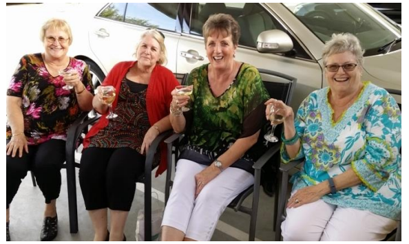
Bottom row L to R:-IW Day at Royal Botanic Gardens in Melbourne; A77 pre-dinner drinks Gayndah style.