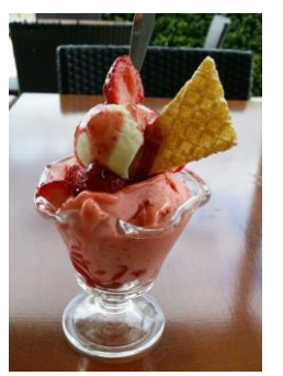
Top row L to R:-Receiving a Tassie cheeseboard from A80 DC Colleen; Canberra Belconnen banner presentation with surprise visitor Usha from India; A70 Strawberry sundae